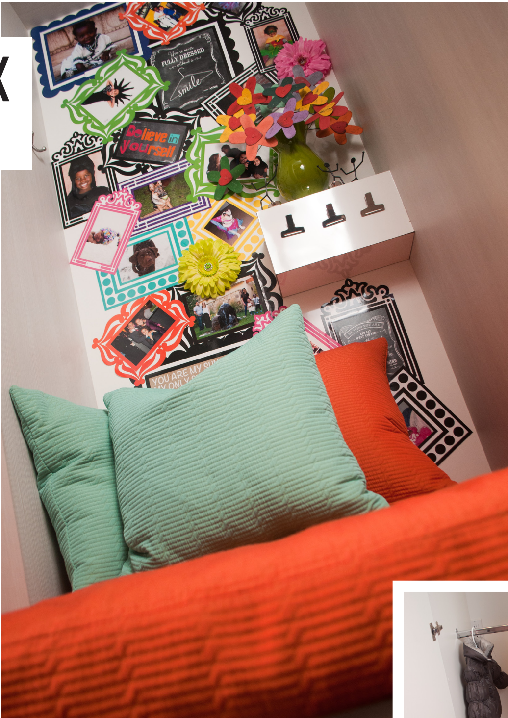
↑ ARTFUL NOOK A comfortable place to put on shoes and be inspired by family photos and kids' art.

It's a dog's life — a built in doggie daybed and a bright and cheery wallpaper.