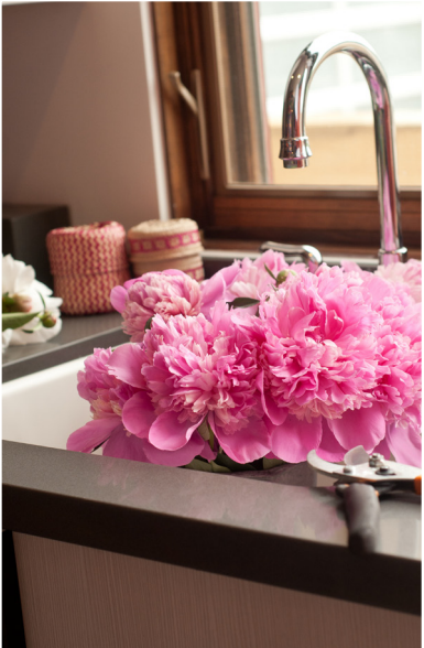
→ YIN & YANG Bold color contrasted with serene white for an artful balance. A continuous countertop creates ample space for folding.